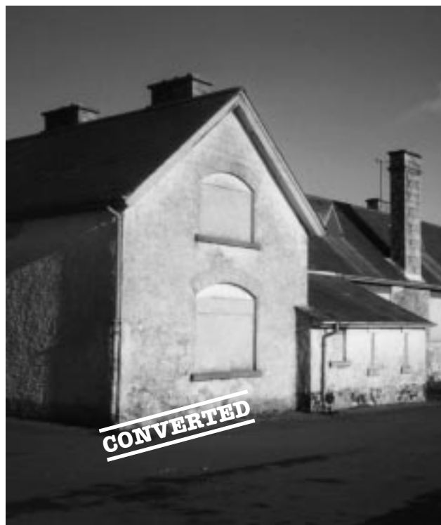
Fivemiletown Old Primary School

Although never appearing as a building at risk, this curious former Georgian house has been converted to offices by the local council after lying vacant for a number of years.