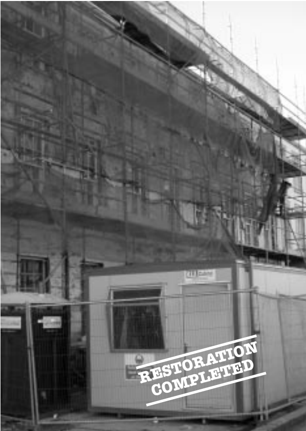
127-131 Ormeau Road No.123 Ormeau Road appeared in BAR Vol. 2, p.16. Similar to it, several fire damaged properties in the terrace have now been repaired.