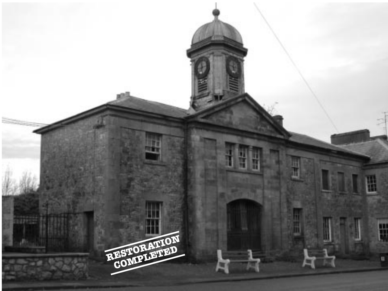
Caledon Court House

Work has just been completed on the former court house as part of another successful Townscape Heritage Initiative scheme (BAR Vol. 1, p.112).