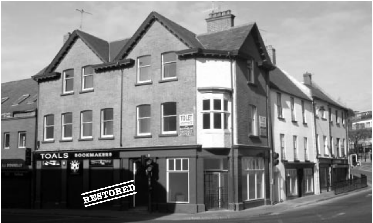
1/3 Market Street, Downpatrick

As with no. 5 Irish Street, the restoration of this substantial corner property has been completed under a recent Heritage Lottery Fund scheme.