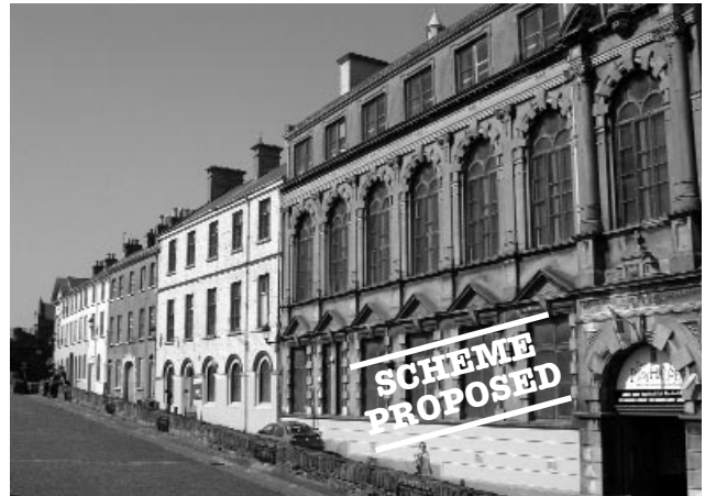
The Playhouse Theatre, Artillery Street, Derry

A long-term building at risk (BAR Vol. 2, p. 70 and BAR Vol. 4, p. 95), this is now a restaurant, having been restored with assistance from the International Fund for Ireland.