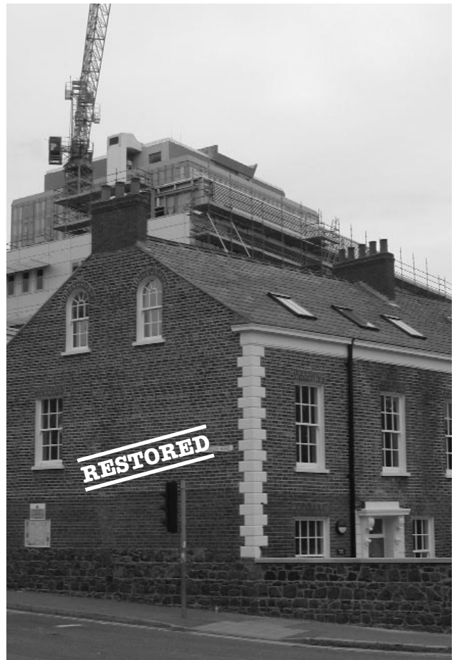
95 Lisburn Road

An extremely successful reuse scheme was undertaken by Belfast Buildings Preservation Trust on this redundant late-Georgian church, which was highlighted in BAR Vol. 1, p. 33 and BAR Vol. 3, p.20. It is now used by the Royal Belfast Academical Institution, the Trust's partner in the project, as a library and IT facility.