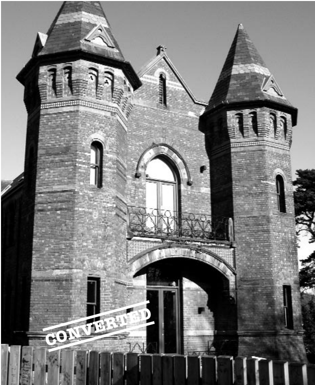
Throne Hospital, Whitewell Road

Now devoid of its setting this former hospital building has finally been converted for use as offices (BAR Vol. 4, p. 27).