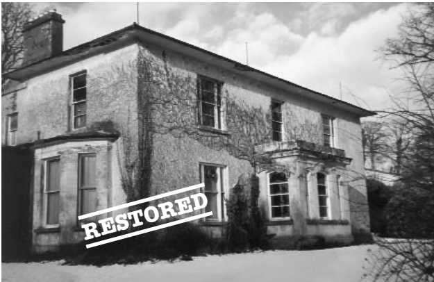
Glenanne House, Glenanne

Included in BAR Vol. 1, p. 45, this former dwelling has been extended and converted for use as a restaurant.