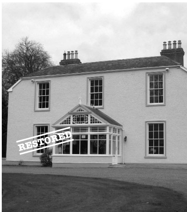
Lisnamallard House, Omagh

Work has just been completed on the former court house as part of another successful Townscape Heritage Initiative scheme (BAR Vol. 1, p.112).