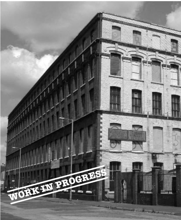
Conway Mill, Falls Road Finally listed in 2000, this former flax spinning mill is undergoing restoration by a local community group.