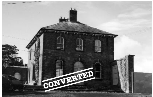
Former Railway Station, Dromore

Previously included in BAR Vol. 1, p. 67, this two-storey four-bay farmhouse is now a family home.