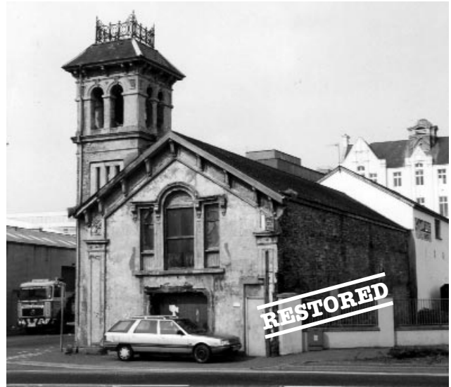
Boating Club, Quay Lane, Derry

A long-term building at risk (BAR Vol. 2, p. 70 and BAR Vol. 4, p. 95), this is now a restaurant, having been restored with assistance from the International Fund for Ireland.