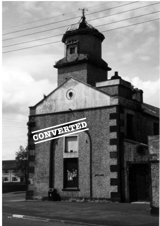
Former Market House, Dervock A CRISP scheme has successfully converted this unlisted structure, which featured in BAR Vol. 2, p. 12.