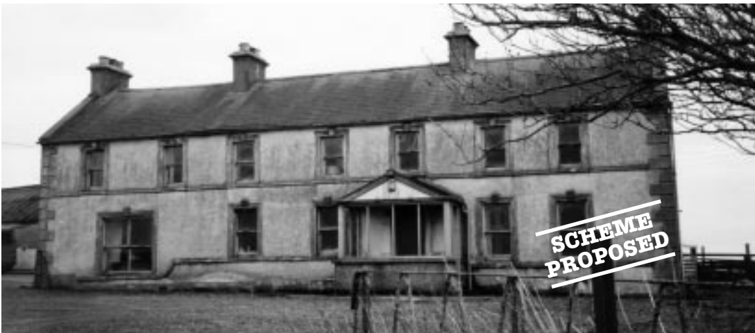
55 Hogstown Road, Donaghadee Noted in BAR Vol. 6, p.53, this vacant farmhouse has recently been listed and is soon to be restored by the owner.

Sited at one of the main entry points to the town this mid-19th century structure has been reused as a childcare facility (BAR Vol. 6, p. 84).