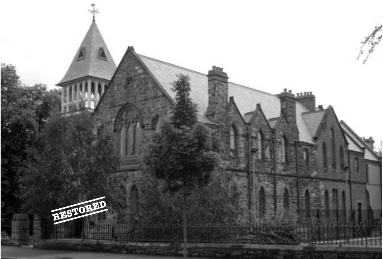
Old Belmont School

The upper floors of this prominent Queen Anne Revivalist building had been deteriorating for some time but have since been repaired.