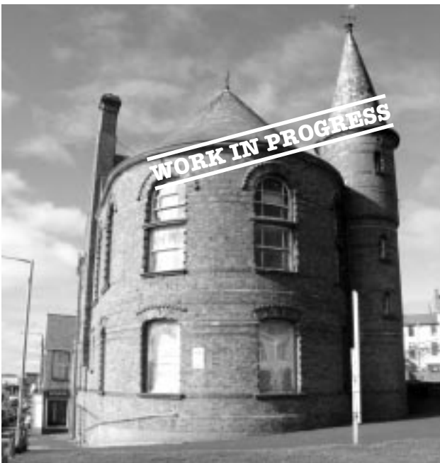
Portrush Town Hall Hearth is currently on site with the restoration and reuse of this important listed building, which appeared in BAR Vol. 2, p. 13. Upon completion it will become a community facility, in association with Coleraine Borough Council.