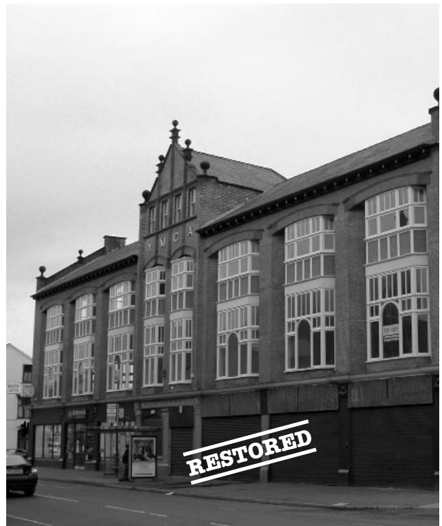
Mount Pottinger YMCA, 179-197 Albertbridge Road

Now devoid of its setting this former hospital building has finally been converted for use as offices (BAR Vol. 4, p. 27).