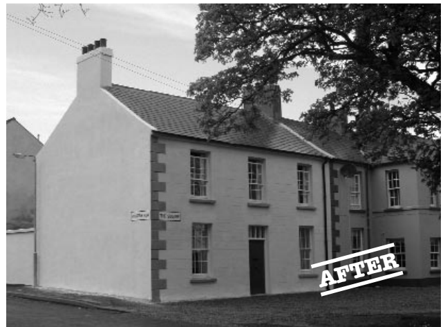
3 Palatine Square, Killough A striking restoration scheme has transformed this important corner building in the Killough Conservation Area (BAR Vol. 3, p. 41).