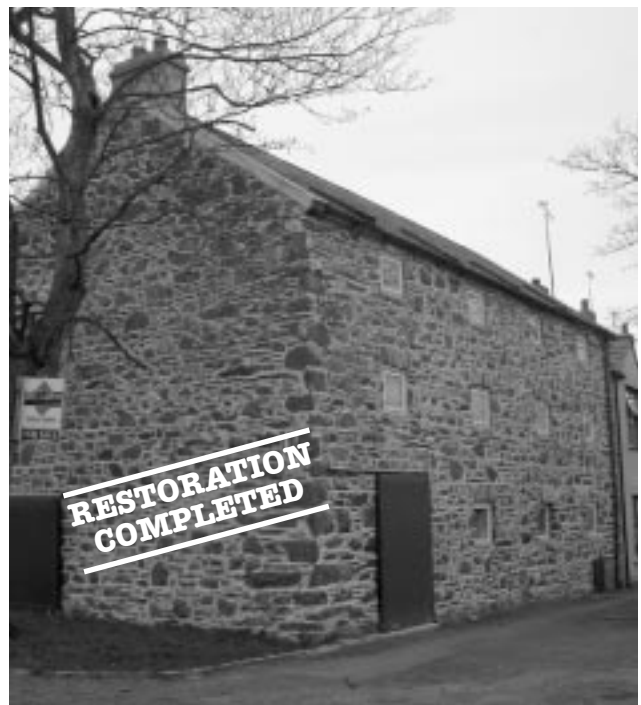
The Corn Store, Main Street, Killough Like no. 3 Palatine Square, this derelict structure has been restored under the Killough Townscape Heritage Initiative.