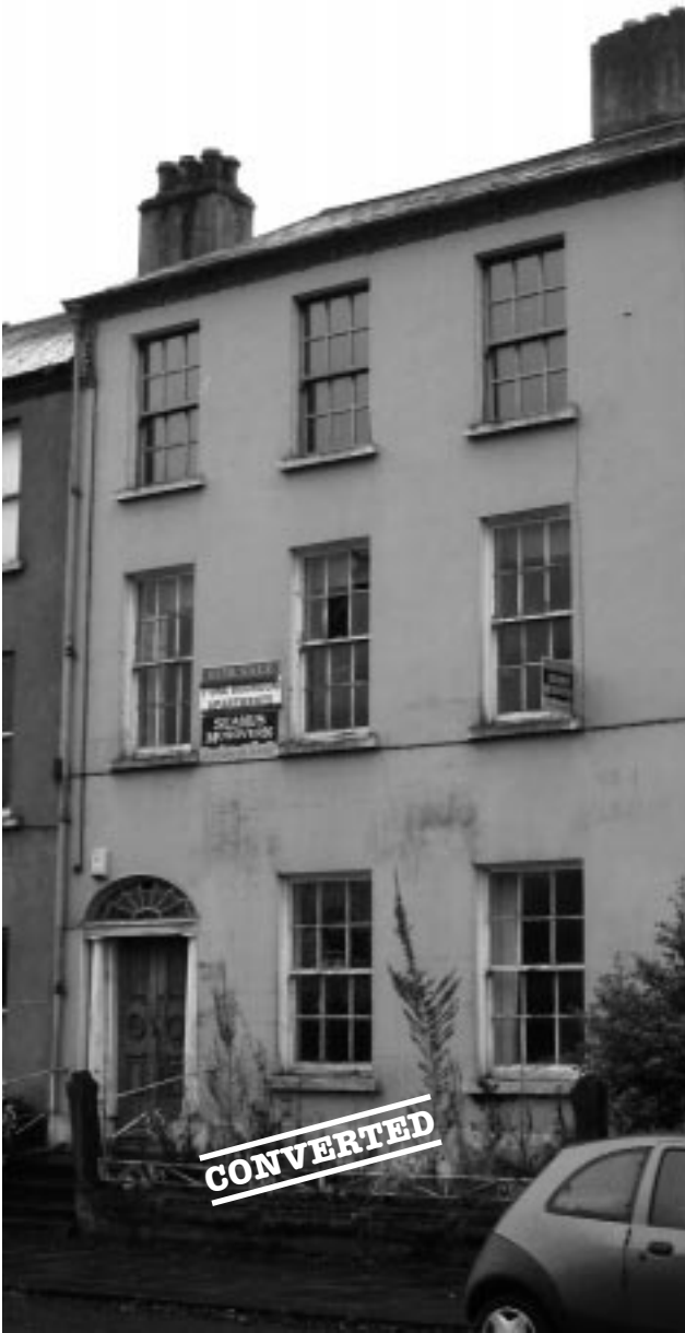
32 Willoughby Place, Enniskillen

Built in the 1840s, this large Italianate structure has been converted to a substantial family home (BAR Vol. 5, p. 70).