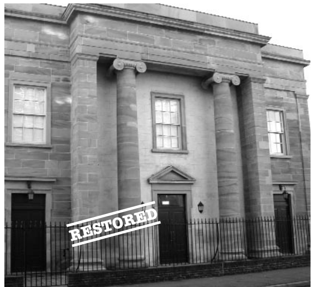
Christ Church, College Square North

An extremely successful reuse scheme was undertaken by Belfast Buildings Preservation Trust on this redundant late-Georgian church, which was highlighted in BAR Vol. 1, p. 33 and BAR Vol. 3, p.20. It is now used by the Royal Belfast Academical Institution, the Trust's partner in the project, as a library and IT facility.