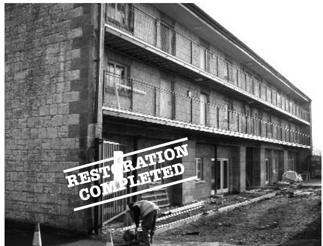
The Corn Store, Moneymore

Included in BAR Vol. 6, p. 108, an Arts Council grant has ensured that this former school will be comprehensively refurbished.