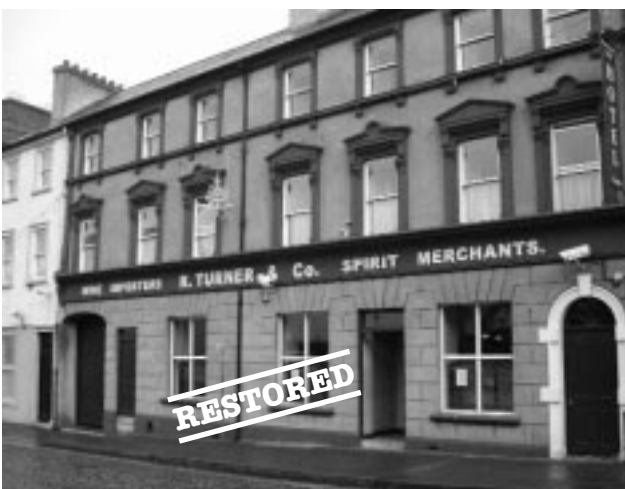
Turner's Coal Yard, Upper English Street, Armagh

Glenanne House (BAR Vol. 6, p. 46) has been sensitively restored but the unusual and vacant gate lodge has been added to the BARNI Register.