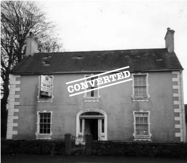
Stonebridge House, Legacorry Road, Richhill

Included in BAR Vol. 1, p. 45, this former dwelling has been extended and converted for use as a restaurant.