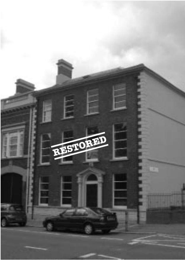
Former RUC Station, Castle Street, Lisburn This red brick former townhouse, included in BAR Vol. 3, p. 9, has been extended to the rear and reused as offices.