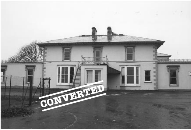
Former Special Care School, Killadeas

Built in the 1840s, this large Italianate structure has been converted to a substantial family home (BAR Vol. 5, p. 70).