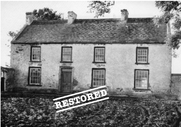
186 Whitechurch Road, Ballywalter

As with no. 5 Irish Street, the restoration of this substantial corner property has been completed under a recent Heritage Lottery Fund scheme.