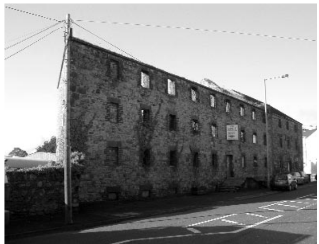
39 Charlemont Street, Moy

Included in BAR Vol. 4, p. 97, this High Victorian Gothic lodge continues to deteriorate.