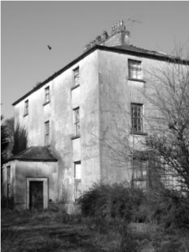
Termon House, Carrickmore

This old rectory of 1815, which appeared in BAR Vol. 5, p. 95, still requires a new use.