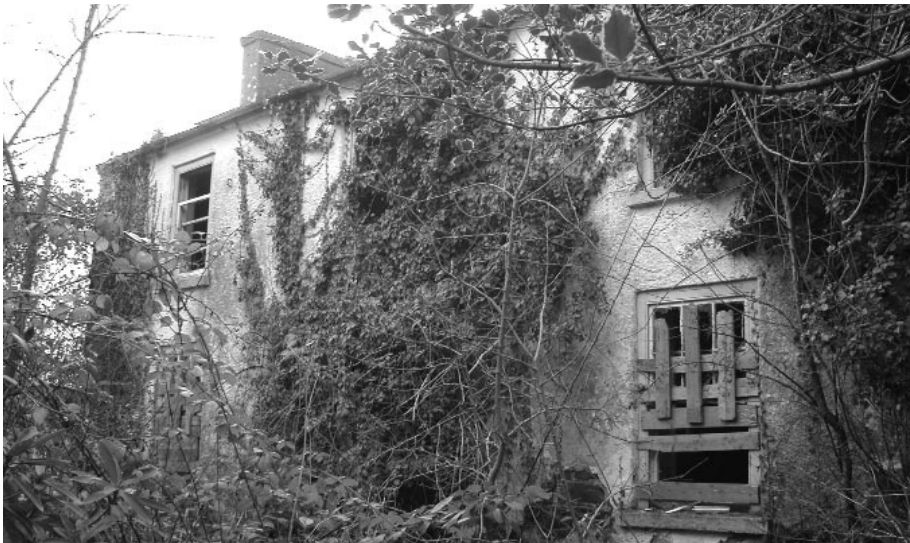
Hollymount House, Craigavon Action is needed soon if this early-19th century farmhouse is to have a positive future (BAR Vol. 4, p. 34).