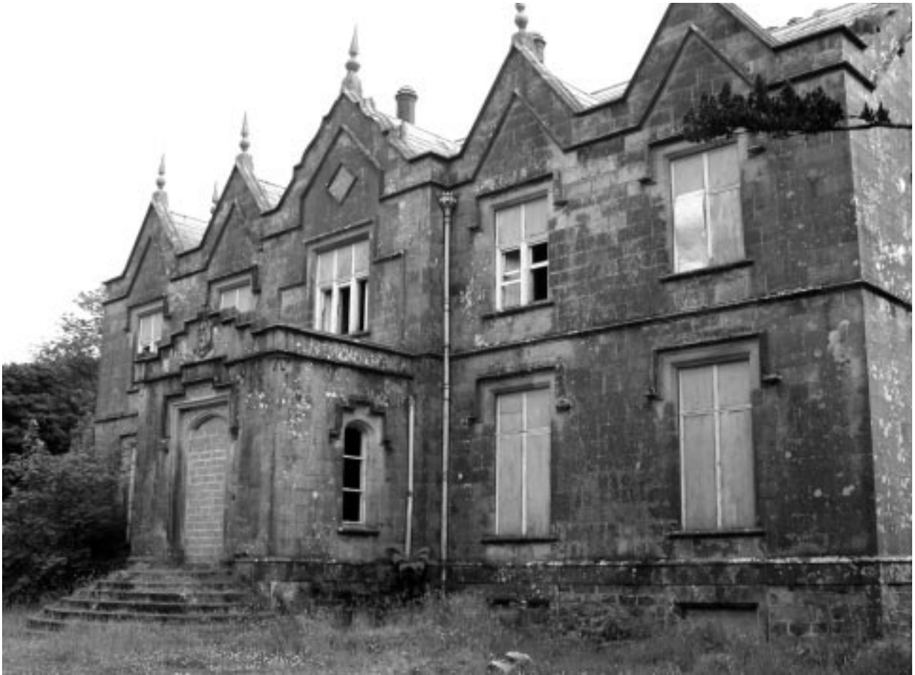
Learmount Castle, Claudy

The unlisted and fire damaged outbuildings have been sympathetically reused but the main house has yet to be restored (BAR Vol. 2, p. 63 and BAR Vol. 4, p. 86).