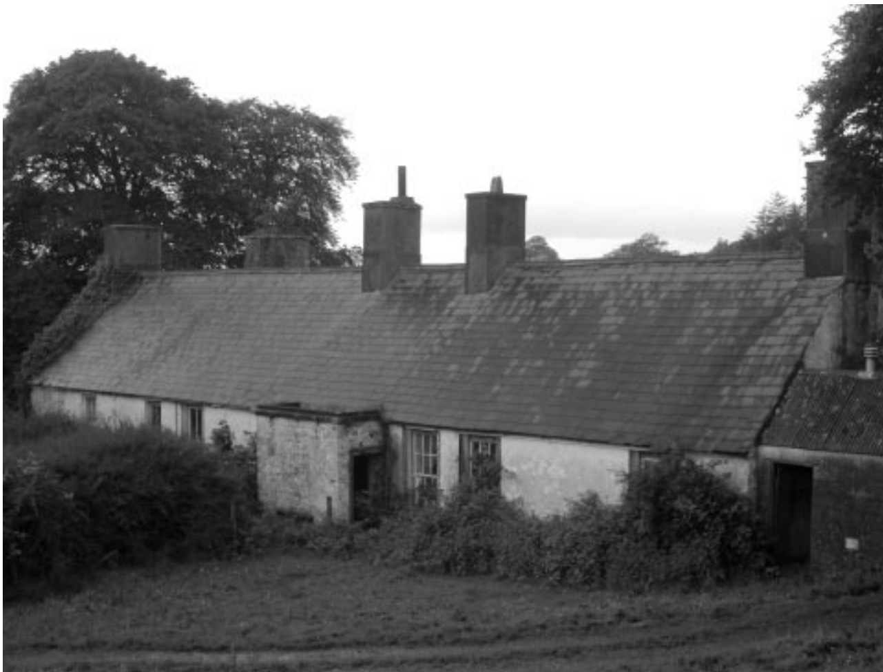
Gardenhill House, Belcoo

The spectacularly sited and unusual Gardenhill House is still in want of a new use (BAR Vol. 6, p. 91).