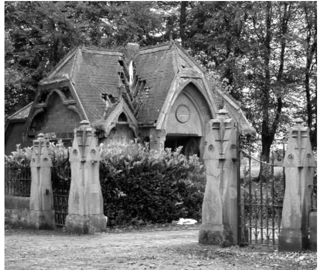
Gate lodge to Bloomhill, Dungannon

This unusual former brewer's house was recently sold but remains very much 'at risk' (BAR Vol. 2, p. 76).