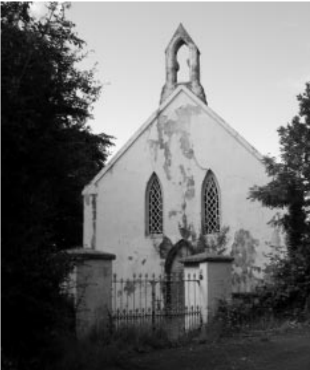
St. Mary's RC Church, Limavady

The unlisted and fire damaged outbuildings have been sympathetically reused but the main house has yet to be restored (BAR Vol. 2, p. 63 and BAR Vol. 4, p. 86).