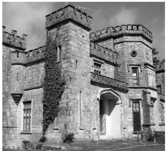
Killevy Castle, Meigh One of a handful of 'at risk' big houses in County Armagh, the dramatically sited Killevy Castle is empty, although in a fair state of repair (BAR Vol. 6, p. 47).