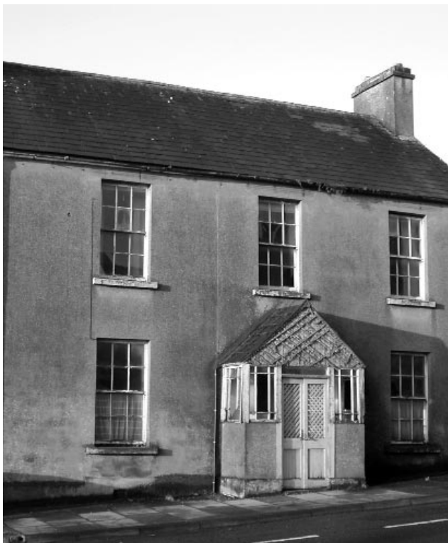
44 Main Street, Newtownbutler

The spectacularly sited and unusual Gardenhill House is still in want of a new use (BAR Vol. 6, p. 91).