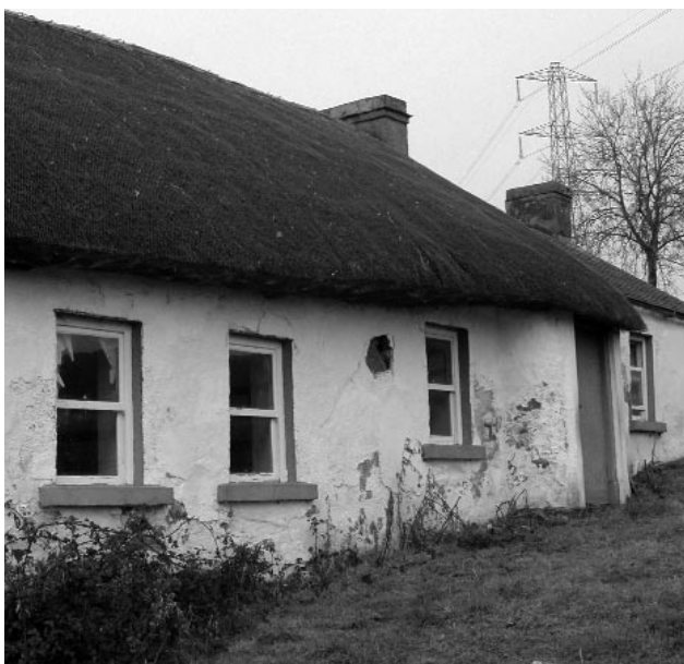
180 Mullalelish Road, Richhill An application for demolition of this partially thatched cottage was made in 2004 (BAR Vol. 2, p. 27).