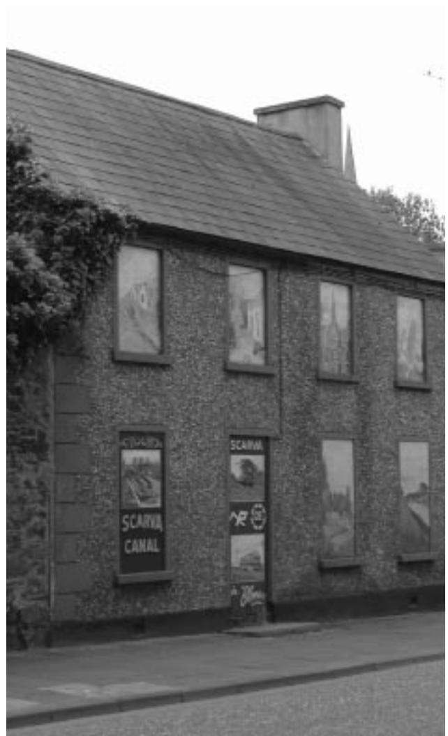
14 Main Street, Scarva

Pictured on the front cover of BAR Vol. 6, the sturdy granite lodge to the Mourne Park estate has yet to be restored.