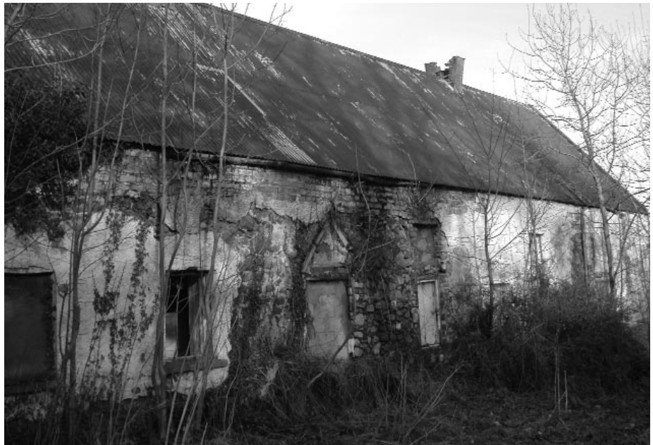
17 Valley Lane, Waringstown Thought to be an early planter's house, this substantial thatched-under-tin dwelling is in an increasingly poor state of repair (BAR Vol. 6, p. 56).