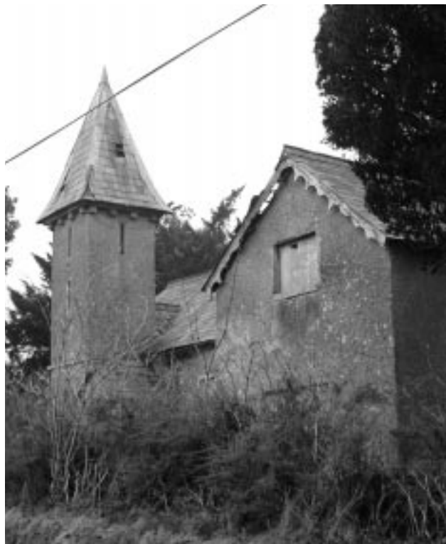
Armagh Manor Court House, Ballagh

This former Temperance Hotel remains derelict (BAR Vol. 6, p. 93).