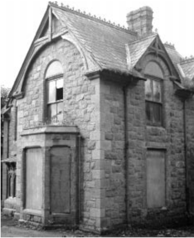
Green Gate Lodge, Kilkeel

Pictured on the front cover of BAR Vol. 6, the sturdy granite lodge to the Mourne Park estate has yet to be restored.