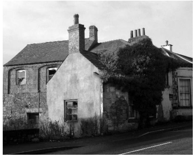
Laurel View Villa, Donaghmore

Proposals to turn the Tudor Revival house and estate into a golf resort have, so far, proven unsuccessful (BAR Vol. 3, p. 91).