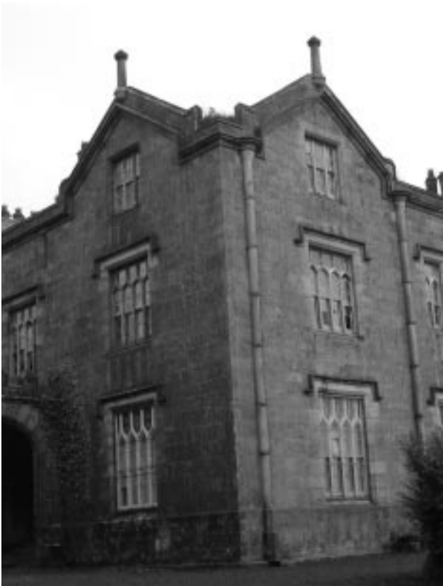
Favour Royal, Augher

This old rectory of 1815, which appeared in BAR Vol. 5, p. 95, still requires a new use.