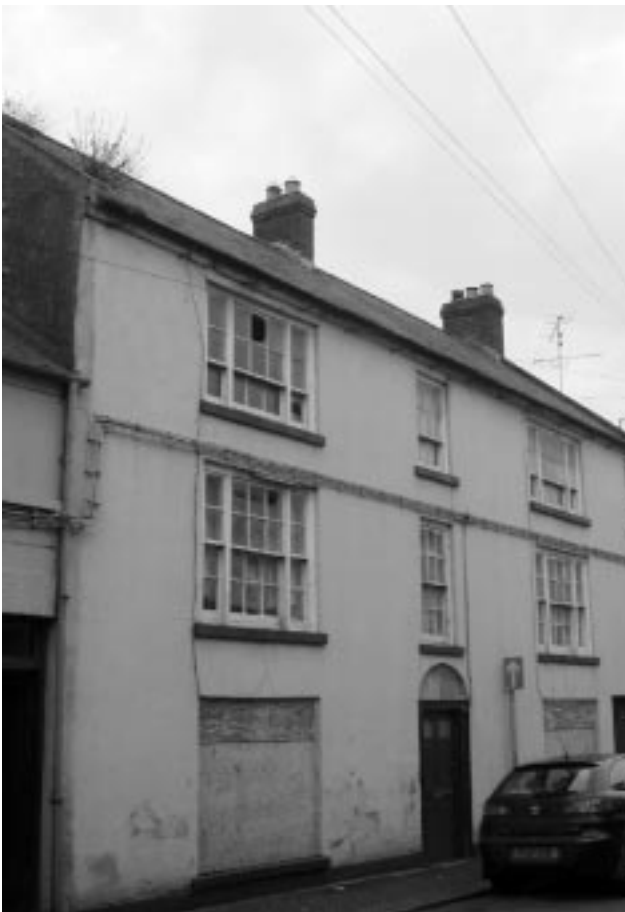
& High Street, Portaferry

Vacant and boarded up (BAR Vol. 2, p. 33).