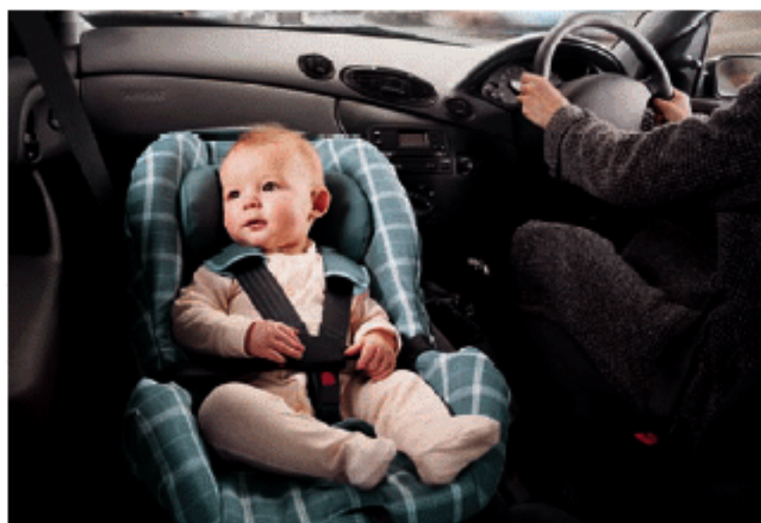
A child in a rear-facing baby seat could be badly hurt by a front air-bag if it deployed

Air-bags are powerful safety devices. A rear-facing baby seat would be hit by a front air-bag if it deployed - and could be thrown up and towards the rear of the vehicle. This means that the baby seat and child could be completely unrestrained during a crash.